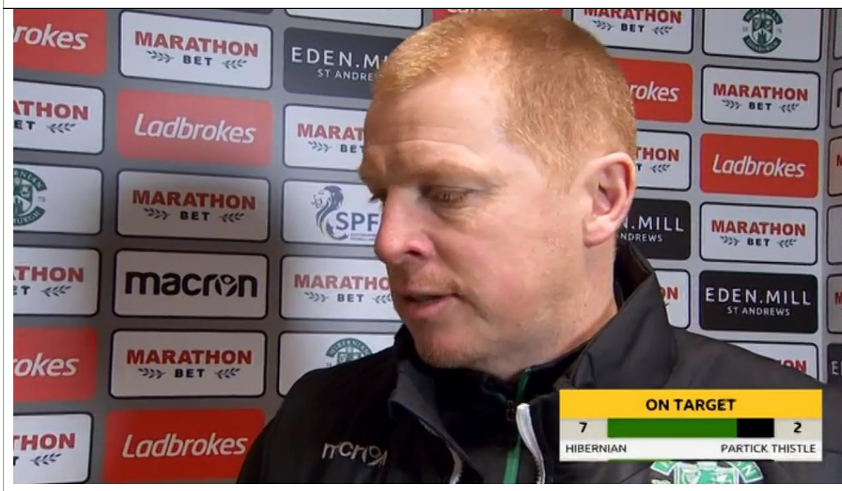
Figure 4.3. Example of Eden Mill sponsorship of Hibernian Football Club in Highlights

Across the two broadcasts, there were a combined 198 alcohol marketing references (Table 4.2). There was, on average, 1.98 alcohol marketing references per-minute in the first broadcast (approximately once every 30 seconds) and 1.05 references per minute in the second broadcast (approximately only every 57 seconds). In both broadcasts, most references appeared around the pitch borders (60% and 80%, respectively) and were static advertising (77% in both). In the first broadcast, the majority of references were for Eden Mill (42%), who were shirt and stadium sponsors of Hibernian football club, who featured prominently in the highlights (Figure 4.3). In the second broadcast, the majority of references were for Magners (63%), because Celtic football club featured prominently in the highlights. In both broadcasts, almost all references depicted brand logos (99% and 100%, respectively) and at least half lasted for four seconds or more.