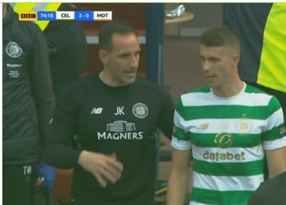
Figure 4.2. Example of Magners shirt sponsorship in Scottish Cup Final

We recorded a live BBC One Scotland broadcast of the 2018 Scottish Cup Final, contested between Celtic and Motherwell. The broadcast provided approximately 195 minutes of footage. Within this period, 164 alcohol marketing references were recorded, an average of 0.84 per broadcast minute (Table 4.2). This equated, on average, to an alcohol marketing reference approximately once every 71 seconds. There was almost an even proportion of references in-play (48%, i.e. during the match action) versus out-of-play (52%, i.e. during pre- or post-match discussions); with the latter plausibly related to the post-match celebrations by Celtic players and staff. Most references appeared on the field of play (70%), were for branded merchandise (84%) and depicted brand logos (95%), thus providing brand exposure in highly visible places when most of the audience would be paying attention. Most references were for cider brand Magners (85%). Similar to the Scottish Premier League game, this was because Magners sponsored Celtic's match shirts and coaching staff attire (Figure 4.2). At least half of the references lasted for three seconds or longer.