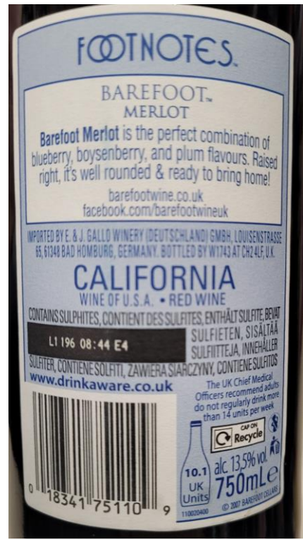
Figure 8. Example of health information in smaller text