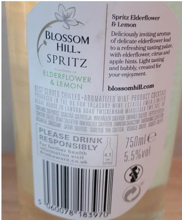
Figure 7. Example of grey font on white background.