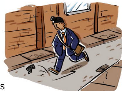
"I don't think it's acceptable, but I think you are just used to it."

We wanted to show decision makers how alcohol marketing impacts people in recovery and children and young people. We listened to people's views and experiences, then brought them to life through animations. The people we worked with provided the voiceovers for the animations.